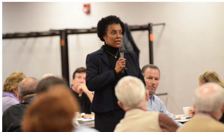
Lots of questions and lively discussions surfaced during the Faith In Our Future Cohort training sessions held in mid-March throughout the four-county Diocese. Here, a Burlington County parish core team member takes the microphone during the session held in St. Isaac Jogues Parish, Marlton. For full coverage of this training session, visit TrentonMonitor.com and click on NEWS>OUR DIOCESE.

The 20 or so members of the Planning Commission are priests, deacons, women religious, and lay men and women from all four counties of the Diocese who have been identified because of their experience in the